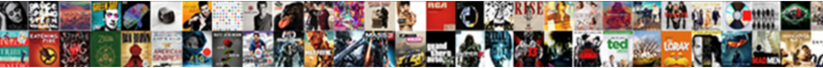
Figure Out Words From Letters